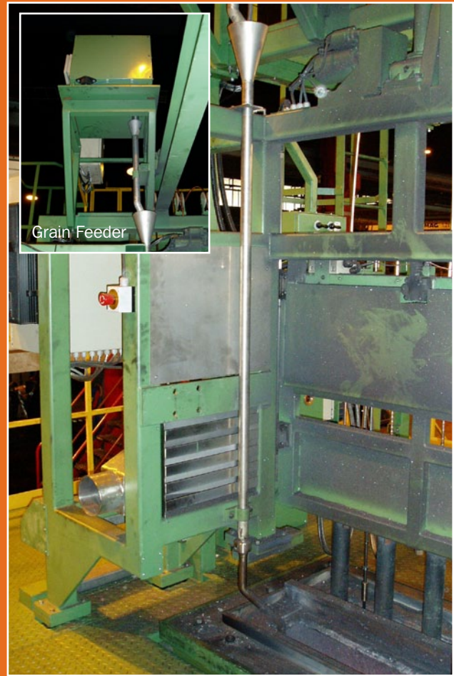
Automatic Grain Feeding