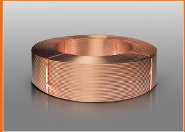
Coil of ACR Tube