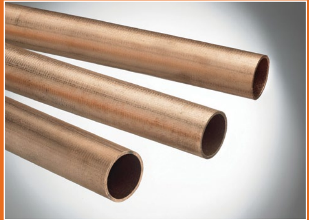
as-cast copper tube shell